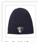
New Era Knit Beanie