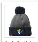
New Era Colorblock