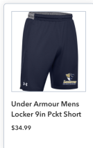
Under Armour Mens Locker 9in Pckt Short $34.99