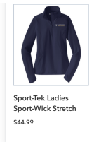
Sport-Tek Ladies Sport-Wick Stretch $44.99